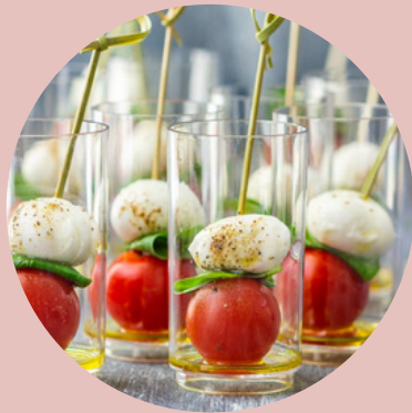
CAPRESE SALAD BITES