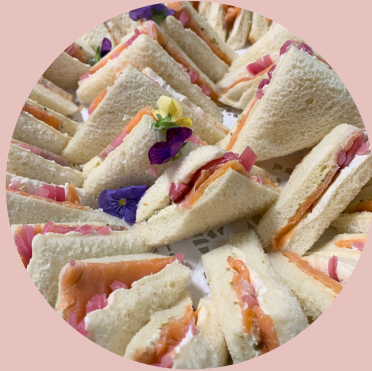
SMOKED SALMON TEA SANDWICHES

Two bottles of champagne with an array of juices.